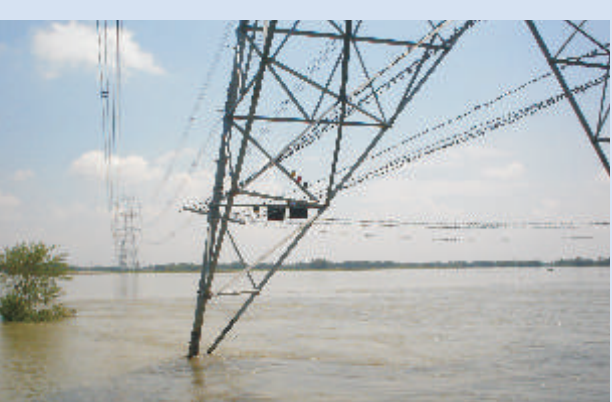
Devastating Flood at Madhepura Dist

The training was also imparted with the help of experts in the organization and specialized