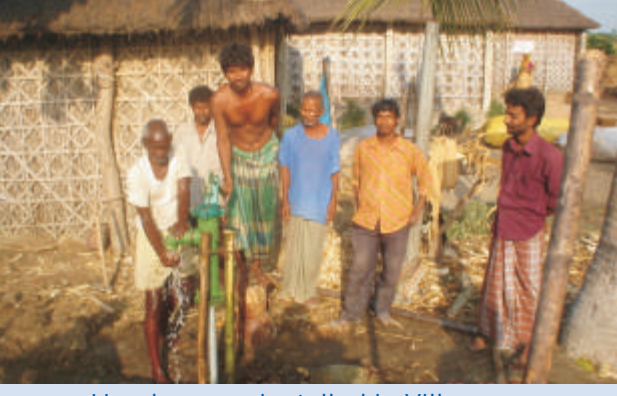
Hand pumps installed in Villages

The Company has organized programs from time to time on "Safety, Health and Environment Awareness" for the staff working on the project of the Company.